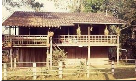
Our comfy, hand-built home in the Village