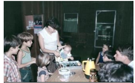
Celebrating a birthday in our Village Home