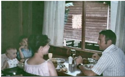
Sitting at lunch, note Nyaw house in background